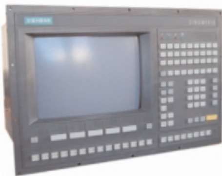
SINUMERIK 805, 810, 820, 840, 850, 880