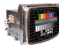
CRT 14" colore