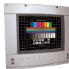
LCD per BC 120